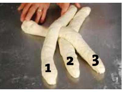
3 Cross strand 1 over strand 3. Strand 1 is now the middle strand.