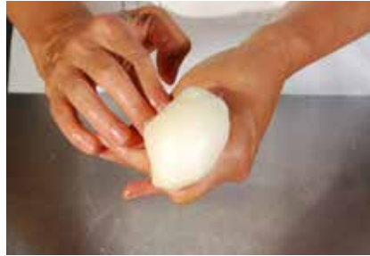
1 Tuck the edges of the dough 2 Pinch the bottom together.

Tuck the edges of the dough underneath to create a smooth round top.