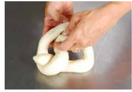
4 Pass it over then through the 5 Take the loop into loop of the "e".