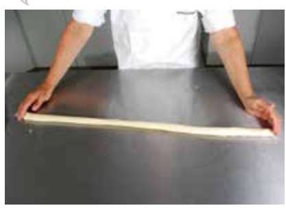
1 Form a bâtard then roll dough into a long, even strand.