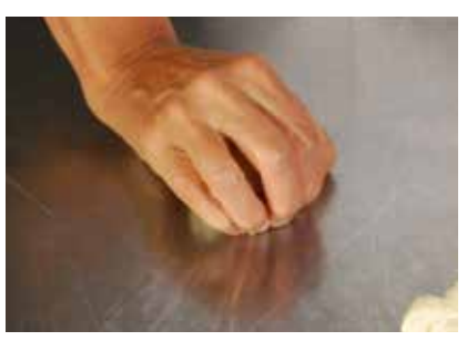
3 Place the dough round side up and, with a light grip, roll dough on the counter.