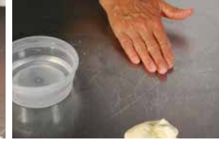
5 The dough should stick a little to the counter; if it keeps sliding apply a small amount of water onto the counter.

4 The dough should be able to move within your hand.