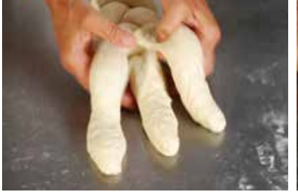
8 Take the unbraided half, and flip it over so the loose strands are facing you.