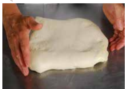
1 Shape the dough into a rough rectangle or square.