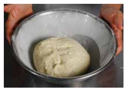
6 Dust the dough with flour and place the dough seam side up in a bowl.