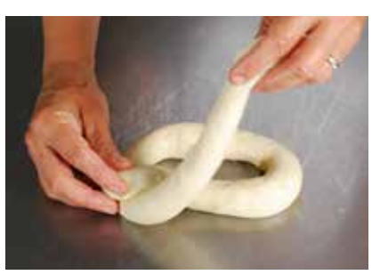
3 Pick up the bottom end of the "e".

2 Shape the strand into the shape of a lowercase "e", facing away from you.