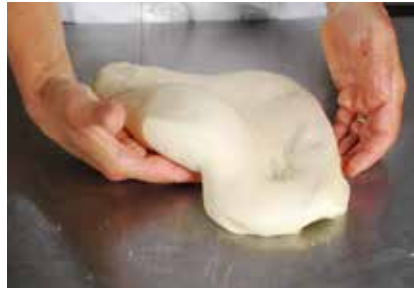
2 Fold the four corners under to form a round top.