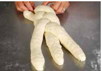
4 – 6 Continue folding the outside strands over the middle strand until the end.