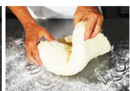
2 Lift one side of the dough.