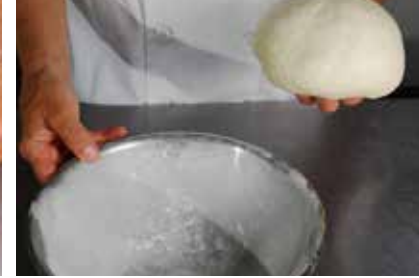
5 Prepare the bowl by dusting with flour.