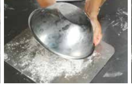
2 Carefully invert boule onto a floured baker's peel.