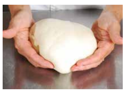
3 Gently cup the dough ball in your hands.