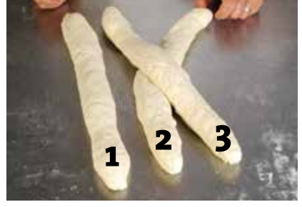
2 Cross strand 3 over strand 2 in the middle. Stand 3 is now the middle strand.