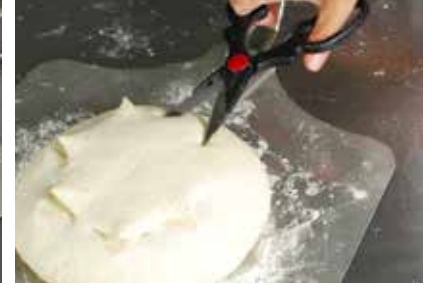
2 Cut all around the circumference of the boule.

1 Using clean kitchen shears, make small cuts into the surface of the dough. The cuts should be about 1 inch wide and ½ inch deep.