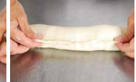
7 Pinch to seal the folded edge. 8 For a bâtard loaf: transfer bâtard seam side down into a loaf pan or on a baking sheet.