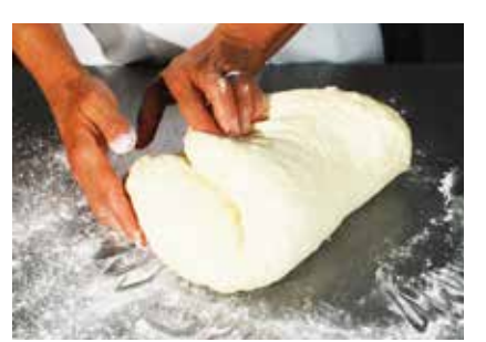
3 Fold the dough in half.